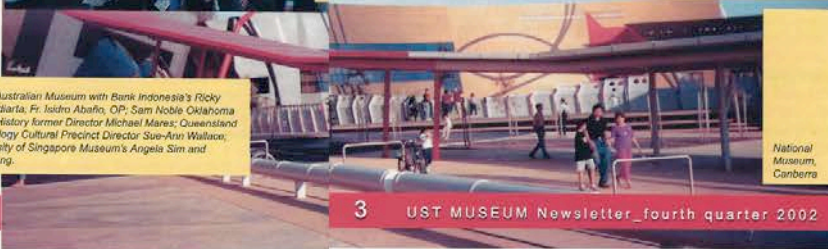
National Museum, Canberra