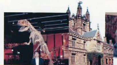
Chinese Dinosaur exhibition Australian Museum, Sydney