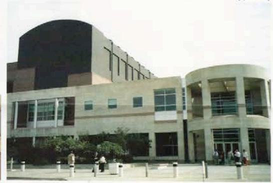
Below, from left: one of the storage facilities visited by the UMAC delegates and a behind-the-scenes workshop at the SNOMNH; the exterior of the Sam Noble Oklahoma Museum of Natural History (SNOMNH)