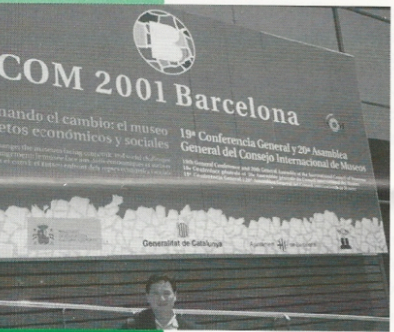
the Palau de Congressos in Barcelona, Spain

other hand, a manager may be good in Finances and Human Resources, but he may not have the appreciation for the true sense and value of art. He may look at art as a commercial commodity but not a translator of culture.